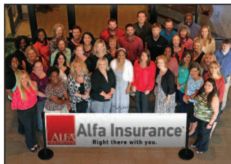
Meals on Wheels Route Partner ALFA Insurance

[NOTE: MACOA is following CDC guidelines to promote a safe environment for their employees and volunteers]